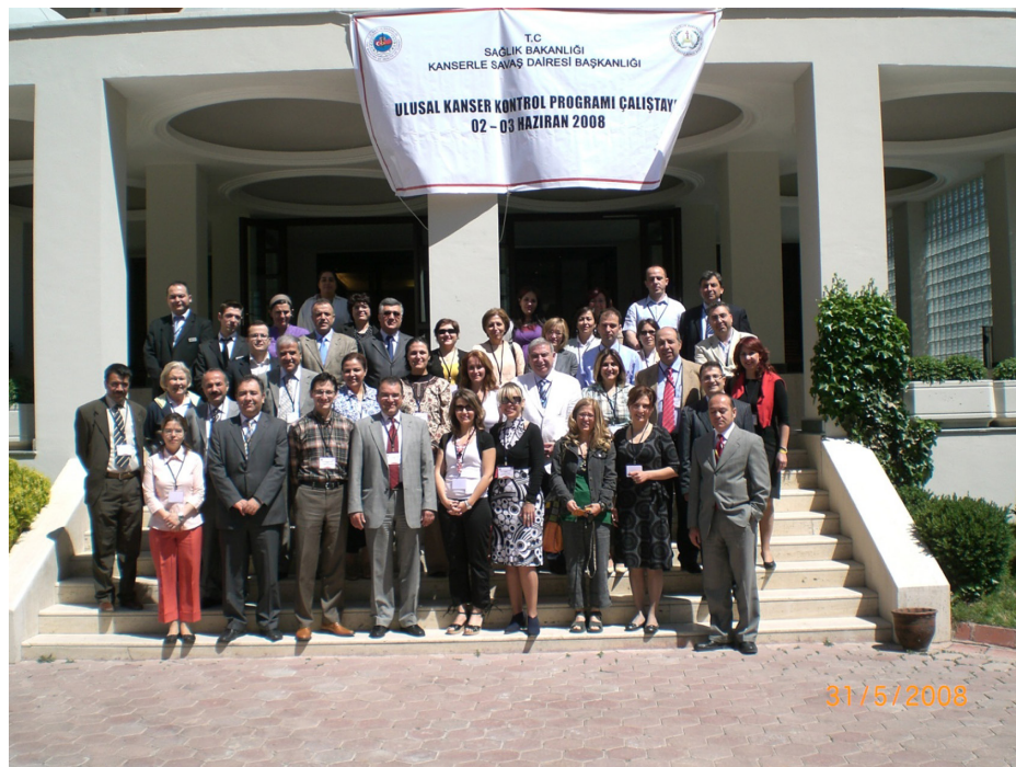
Figure 1. 2010–2015 National Cancer Control Program Workshop 2, Ankara.

It was suggested that these centers, which have a multidisciplinary team, should be established in health facilities with high labor standards and in the Public Hospital. After patients