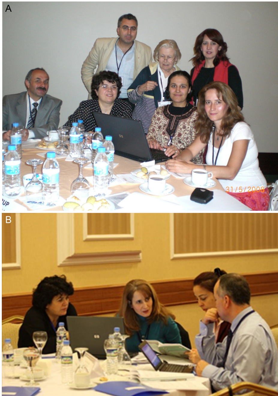
Figure 2. A, B.